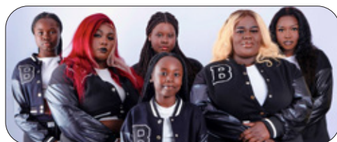
Unbreakable Dance Crew

BUTCHULLA & GUBBI GUBBI WOMAN, EQUALITY ADVOCATE, GENERAL MANAGER - FOOTBALL AUSTRALIA, QUEER SPORTING ALLIANCE