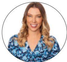
Jonty Bush MP (F) MEMBER FOR COOPER, COMMUNITY SAFETY AND VICTIMS' RIGHTS ADVOCATE

When we call out the inappropriate behaviours of boys and young men, we still hear the refrain 'ah well, boys will be boys' – in schools, in the workplace and at home. And with younger and younger boys being drawn to harmful social media influencers, this issue is becoming increasingly urgent. This panel will unpack these issues around toxic masculinities, incel culture and male mental health and share solutions to move away from the norm of 'boys will be boys' and promote healthy models of masculinity for young men.